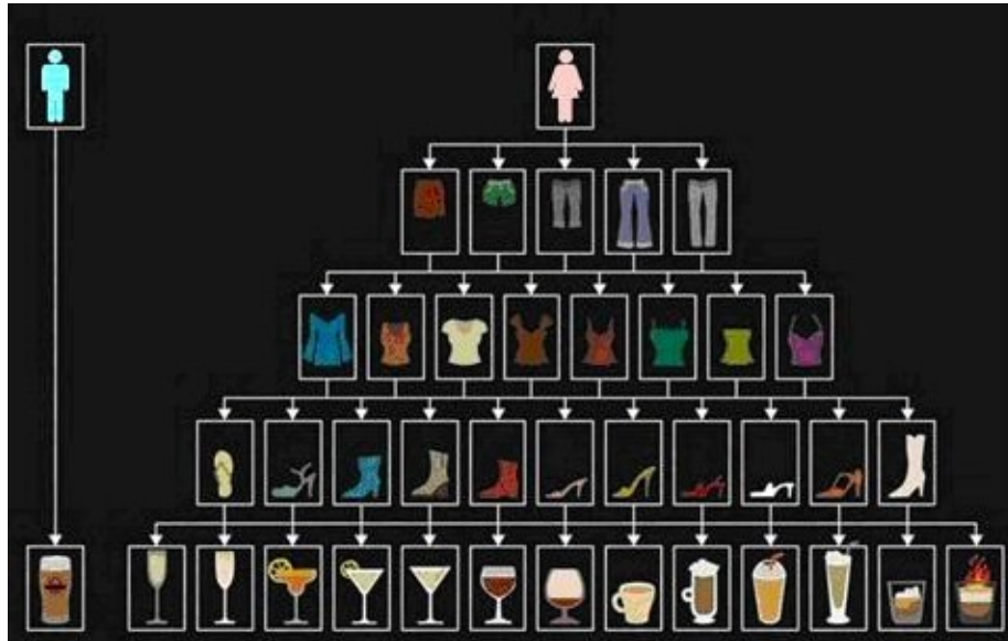
from Funny Differences Between Male and Female Brains

Now, to carry this one step further to prove there really is a difference between male and female brains when it comes to making simple basic decisions consider this second diagram titled Let's Have a Drink and Then Go to Bed.